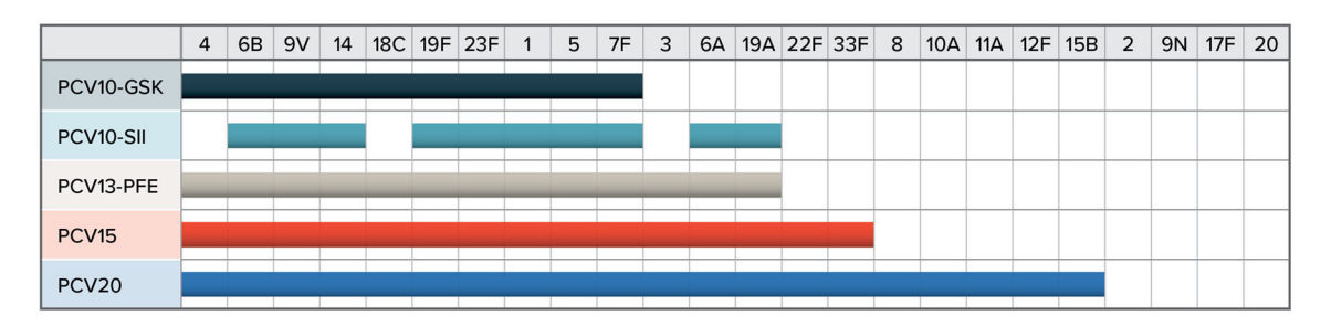
Fig. 1 Serotype coverage. The serotypes covered by each pneumococcal vaccine. GSK GlaxoSmithKline, PCV10 10-valent pneumococcal conjugate vaccine, PCV13 13-valent pneumococcal conjugate vaccine, PCV15 15-valent

Using this model, we formulated five vaccination scenarios: (1) strategy 1, continue with PCV13 (status quo); (2) strategy 2, replace PCV13 with PCV10-GSK; (3) strategy 3, replace PCV13 with PCV10-SII; (4) strategy 4, continue with PCV13 for 3 years then switch to PCV15; and (5) strategy 5, continue with PCV13 for 3 years then switch to PCV20. For the primary objective, the cost-effectiveness of vaccination strategy 1 was compared with strategy 2 and strategy 3. The outcomes of the primary objective included estimated averted disease cases (IPD, pneumonia, and OM), pneumococcal-related deaths, life-years (LYs) saved, quality-adjusted LYs (QALYs) saved, and incremental costeffectiveness ratio from a payer perspective. For the exploratory objective, the public health impacts of strategy 4 and strategy 5 were compared with those of strategy 2 and strategy 3.