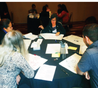
Figure 2. Photographs of maternal and child health practitioners and partners working on behavior over time graphs at the National Maternal and Child Health Workforce Development Center's 2016 Skills Institute.

To conclude the BOT graph session, we asked participants about their reactions to the process of using BOT graphs as a discussion