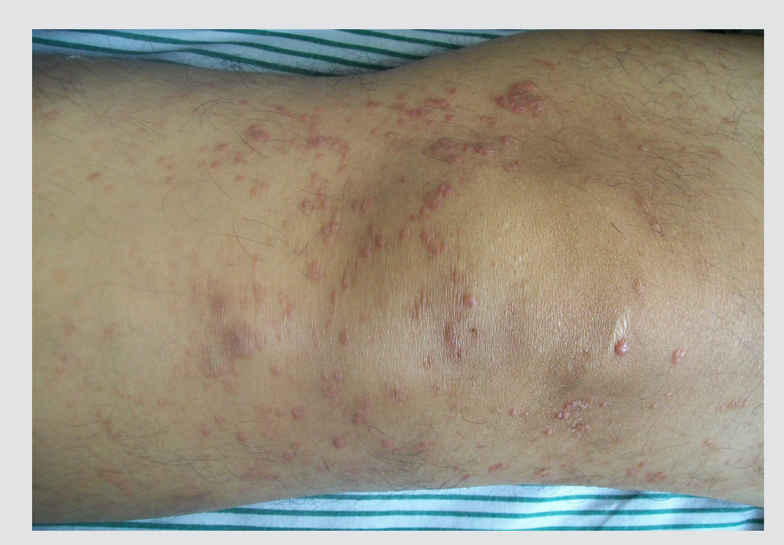
Cutaneous T-cell lymphoma (early stage mycosis fungoides)

Similar appearance of childhood atopic eczema (left) and mycosis fungoides (right). Initial manifestations of CL may resemble those of atopic dermatitis, so cases of eczema may be treated with the study medications (tacrolimus or pimecrolimus), which are intended to treat atopic dermatitis.