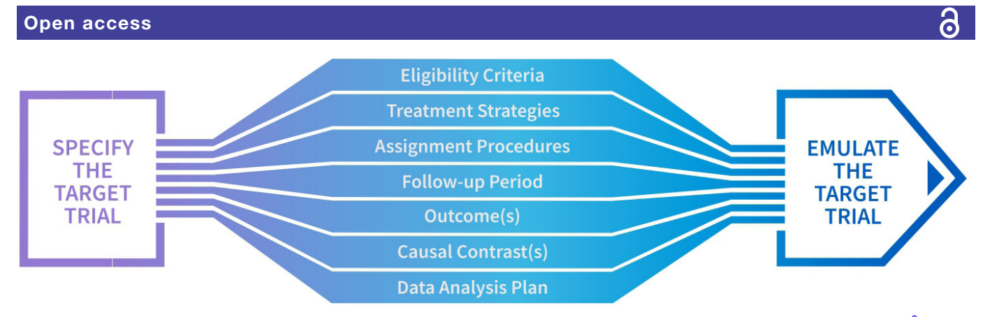
Figure 1 Elements relevant to both the specification and emulation of the target trial described by Hernán and Robins.

Application of the target trial framework requires the complete specification of the target trial protocol and its emulation (figure 1).<sup>3</sup> Hernán and Robins<sup>3</sup> provide a template for specifying a target trial and its emulation; however, there is currently no detailed guidance on reporting a study designed to emulate a target trial. Incomplete reporting of these studies limits the ability of clinicians, researchers, patients and other decision-makers to appraise and synthesise findings or interpret them to inform clinical and public health practice and policy. A reporting guideline that expands on the initial target trial emulation template<sup>3</sup> is needed to provide authors with comprehensive recommendations on how to completely and transparently report a study emulating a target trial.